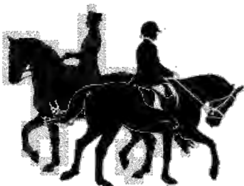
Pass left shoulder to left shoulder.